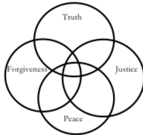
Figure 1. Four Critical Aspects of Reconciliation

solutions to problems, they embody the Jesuit principle of promoting the common good, creating a social and political system that benefits all segments of the population.