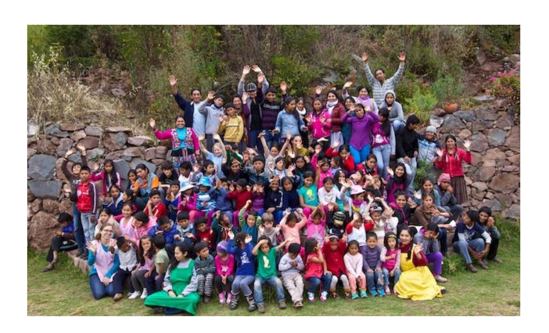
Kusi Kawsay Class Photo

less-developed communities around the world and how to achieve educational empowerment through honoring cultural identities. The Kusi Kawsay Academy truly stands apart from many organizations with their unique and innovative approach. By studying this school, my desire is this thesis can further the conversation about how schools in developing communities can continually improve upon the education received by students of every background.