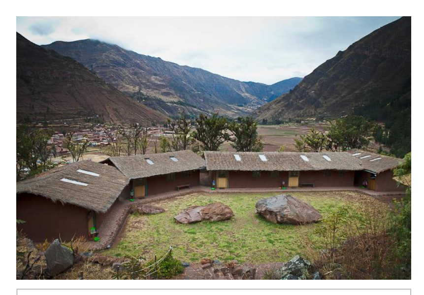
Above is the facility Kusi Kawsay operates in, still in construction due to unavailable funds to finish the school (Dayka, 2012).

Situated in Písac, Peru there is a small academy of modest structure built in the Andes mountain region in the heart of the Sacred Valley. From the front step of the school, one can see clearly over the valley and view the imposing mountain range. By absorbing the views offered by this academy, one can feel a rich sense of history in this area of the world. The century-old slopes stand as a constant reminder of the past to the community in Písac and the community's dedication to this ancestral land is clear. The institution described here is the Kusi Kawsay Academy which is an alternative education school located in Peru not far from Cusco. The school was founded in 2010with a focus on preserving and celebrating indigenous students' native heritage (Kusi Kawsay, 2014).