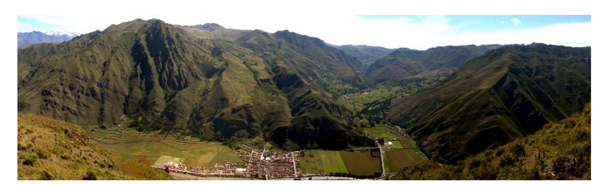
Above is the Scared Valley where the Kusi Kawsay Academy is located (Kusi Kawsay, 2012).

Finally, one must examine the background of the academy. The school was founded in 2010 and currently serves 95 students. Of those students, about 90 have families from indigenous backgrounds and come from the communities of: Viacha, Cuyo Grande, Cuyo Chico, Amaru, Anphay, Pampallaqta and Chahuaytire near Písac, Peru.