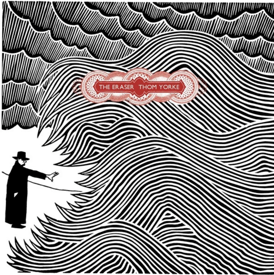
Fig. 1. The Eraser album cover.

The reason for this fascination is quite clearly grounded in contemporary reality—and even more frightening, reality’s affinity with “imaginary medieval disasters.” Both Yorke and Donwood “happened to be in the West Country on the day of the Boscastle flood,” and McClean suggests that “there can be little doubting Yorke’s commitment to the environmental cause” (McClean). Considering the number of Radiohead songs, such as “Sail to the Moon,” or The Eraser ’s “And It Rained All Night,” along with Yorke’s concern for the environmental impact, Radiohead’s own impact on local environments, not to mention Yorke’s refusal to meet with Tony Blair, confirm McClean’s assessment about Yorke’s commitment to environmental causes and refusal to pander to authorities who wish merely to camouflage mistakes with celebrity endorsement.