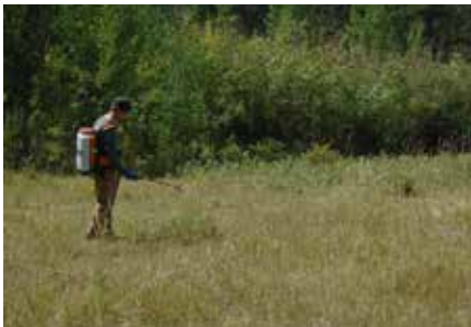
Larimer County Weed Crew member spraying Sulphur Cinquefoil along Elkhorn Creek