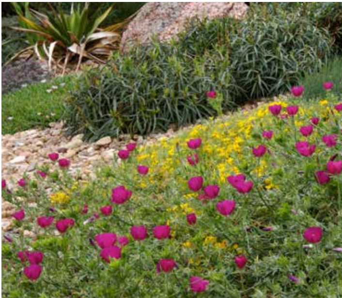
Callirhoe involucrata 'Prairie Cherry' Winecups

Not yet available, this is a seedling selection developed by Brian Core from Little Valley Wholesale Nursery (Brighton). The species is native to central & SW US and is a tough, extremely drought tolerant ground-covering perennial growing less than 12" tall and spreading up to 60" across. This new form has cherry red flowers, and offer all the other attributes of the species.