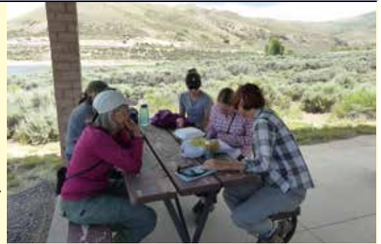
Gunnison area field seminar

Lodging and Camping Options are listed on the CoNPS calendar on the registration page.