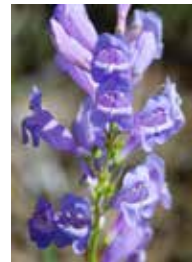
P. richardsonii var. dentatus (below)