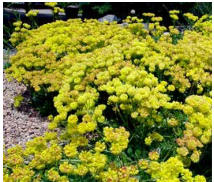
Eriogonum umbellatum var. aureum 'Psdowns', KANNAH CREEK Buckwheat

This selection from the Western Slope of Colorado was chosen for its robust growth and larger yellow flower clusters. Foliage is evergreen, often maintaining a dark burgundy red color through fall and early winter.