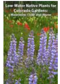
Booklet cover