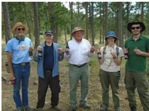
Winners of the root digging contest

As the summer proceeded, the committee started learning more and more about the ecology of sulphur cinquefoil. Surveys were conducted that expanded knowledge of the local population area some 20 times. Ultimately,