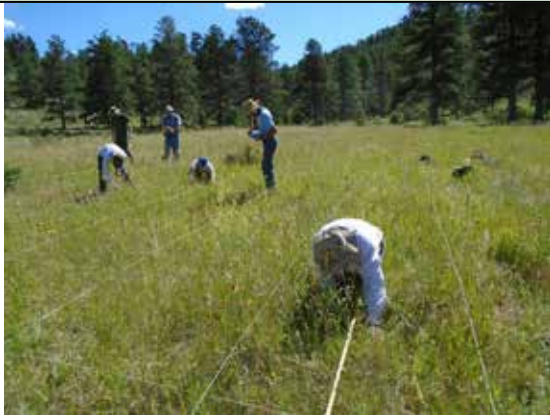
Counting plants in the study plots

surveys uncovered “satellite” (e.g. isolated) occurrences outside of the main infestation which led to questions about dispersal mechanisms. Unlike so many other noxious weeds, P. recta does not appear to be disturbance related or dispersed along roads. The current theory is that seeds are carried in the hoofs of animals during wet periods.