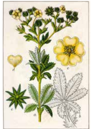
Hohes Fingerkraut, Potentilla recta .

List B species are the next priority and management is aimed at limiting their spread. There are 36 List B species including teasel ( Dipsacus laciniatus ), musk thistle ( Carduus nutans ) and yellow toadflax ( Linaria vulgaris ). There are 16 species on List C which is the lowest priority for management on a regional or county scale. They are included in case landowners wish to manage them locally. List C species include the ubiquitous cheatgrass ( Bromus tectorum ) and mullein ( Verbascum thapsus ).