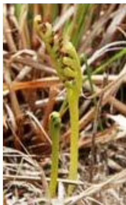
Mature and immature Prairie Moonworts

After not being observed in Colorado since 1997, prairie moonwort ( Botrychium campestre ) was re-located this spring at Bonny Prairie Natural Area. This plant is a member of the Adder's tongue family (Ophioglossaceae), an ancient group of plants distantly related to modern ferns. Moonworts are extremely interesting in that they produce only a single above-ground leaf per year that is divided dichotomously into a sterile, foliaceous part (trophophore) and a fertile, spore-bearing part (sporophore). Most of the plant is below ground, and it does not send up its leaf every year. When a leaf does emerge above ground, it is small and difficult to detect, and is often less than several inches tall. This species of moonwort quickly dies back to the ground after releasing spores, and is only identifiable for perhaps six weeks in the spring.