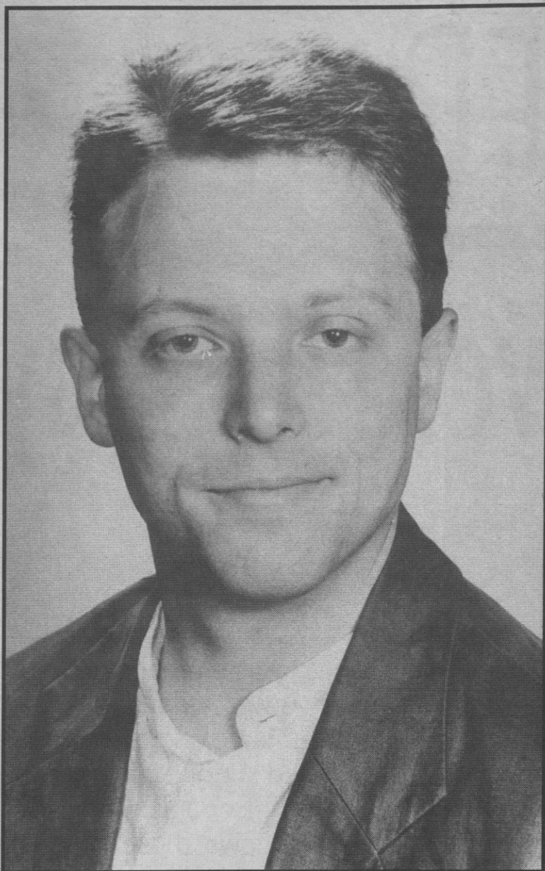
Social critic Tim Wise will address MLK banquet.