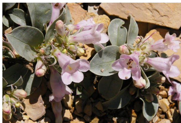
Penstemon debilis , monitored by RPM stewards

In all, volunteers put in over 1,100 hours on these various projects in 2011 alone. All three organizations have identified their target species for 2012 and are putting their field season schedules together. By joining one of the programs you too, can help conserve rare plants in Colorado. The Rare Plant Monitoring Steward Program training will take place in the Piceance Basin May 11-12, 2012. You can register for the training through the Denver Botanic Gardens website.