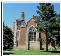
the Holy Cross Abbey in Canon City, Co. ( www.theabbeycc.com )