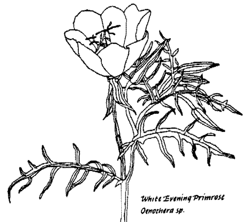
White Evening Primrose Oenothera sp.