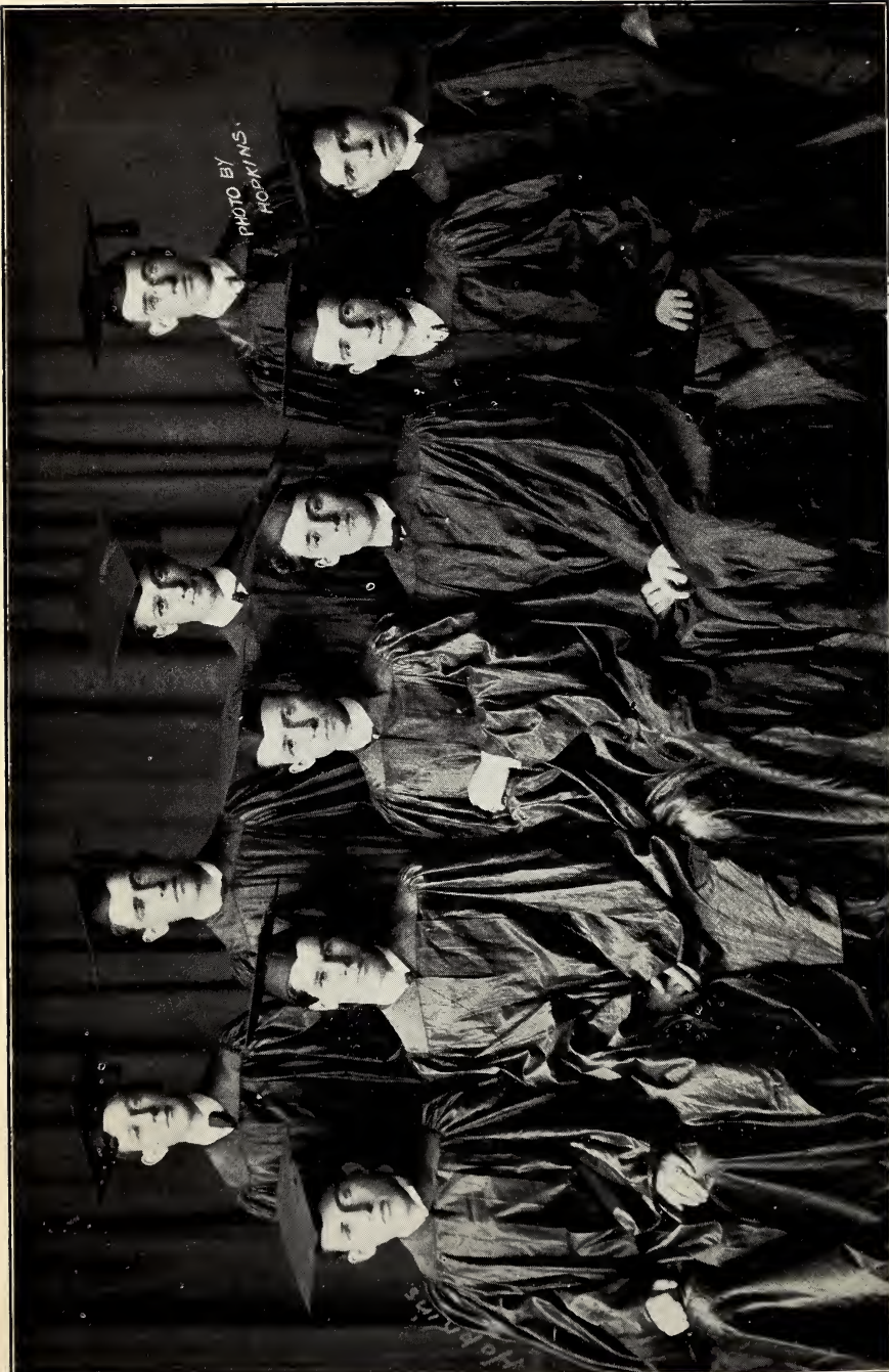
GRADUATING CLASS 1907.