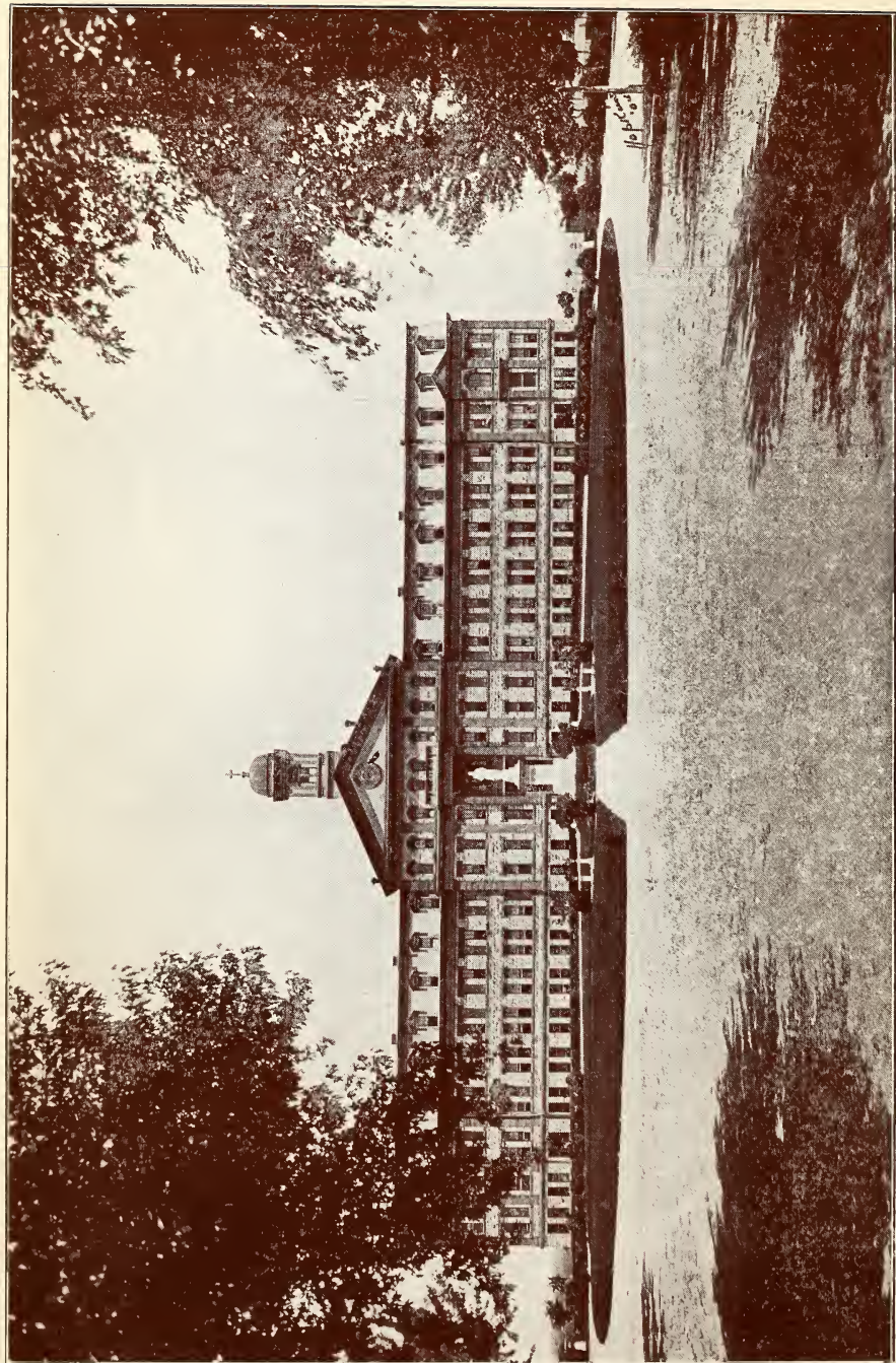
COLLEGE OF THE SACRED HEART.