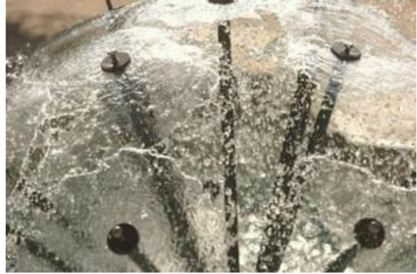
Albers Fountain, Academic Mall, Xavier University