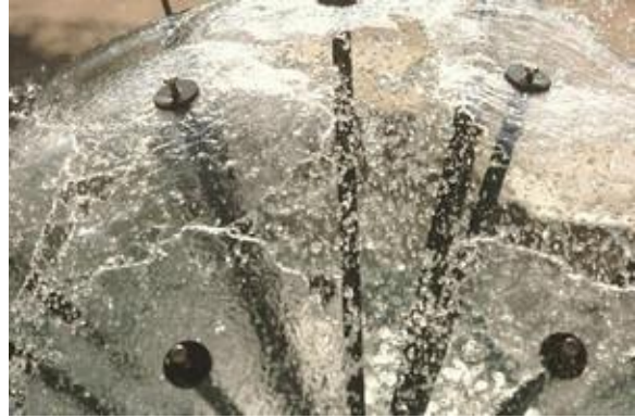
Albers Fountain, Academic Mall, Xavier University