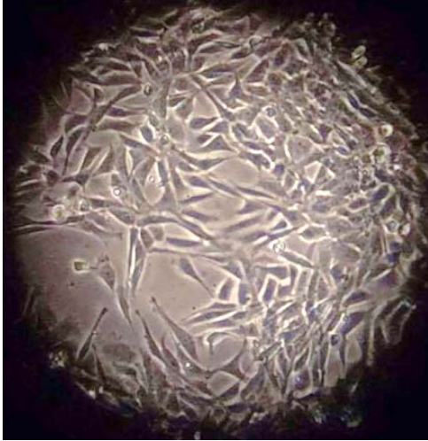
Figure 3. Wild type ts13 cells after 72 hours of incubation with 150 \mu M phenylbutyrate.