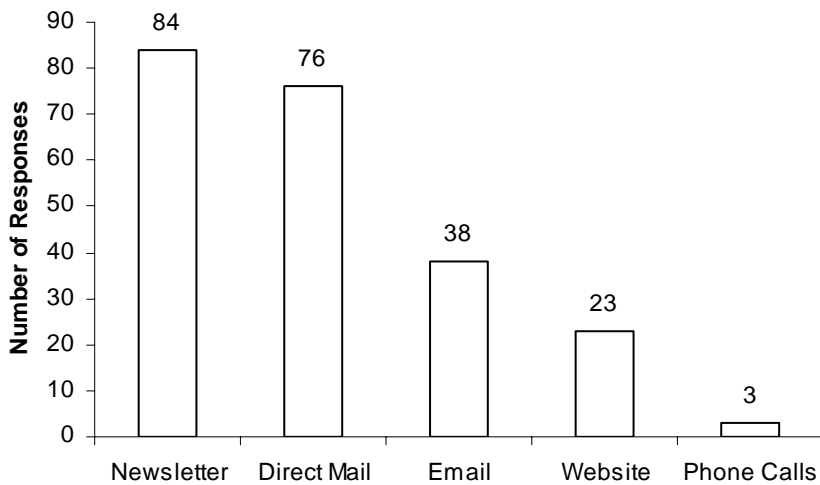
Figure 1. Alumni preferred methods of communication.

Methods of communication. As seen in Figure 1, the top two methods preferred by all program graduates for receiving information are the newsletter and direct mail. Fifty-two percent of the graduates (84 respondents) responded in favor of the newsletter. Direct mail followed with 76 responses to equal 47%. Email received 38 responses (24%), the website as a medium of communication received 23 responses (14%) and phone calls were preferred by only 3 respondents (2%).